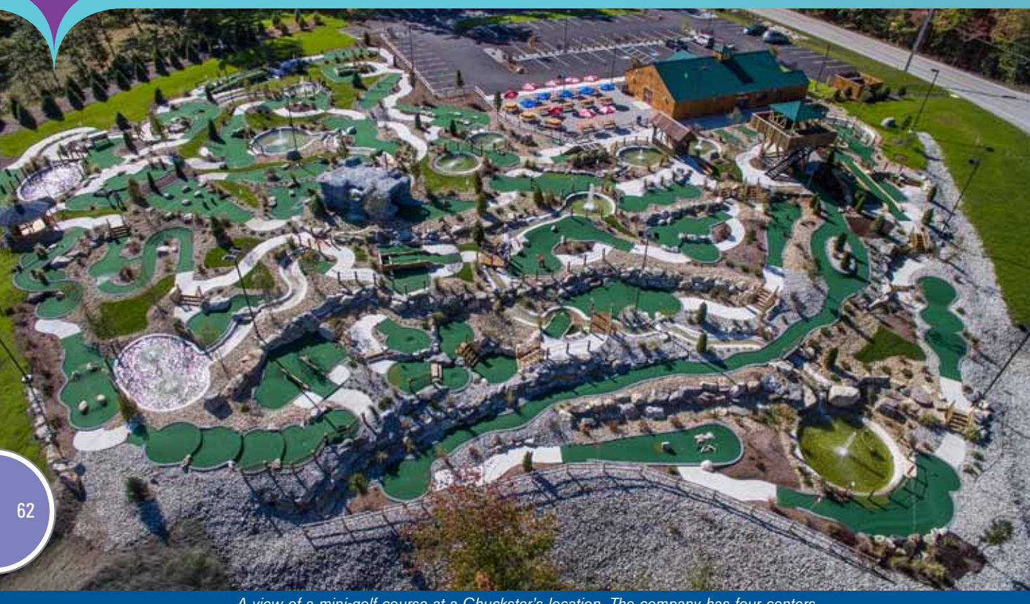
view of a mini-golf course at a Chuckster's location. The company has four centers.