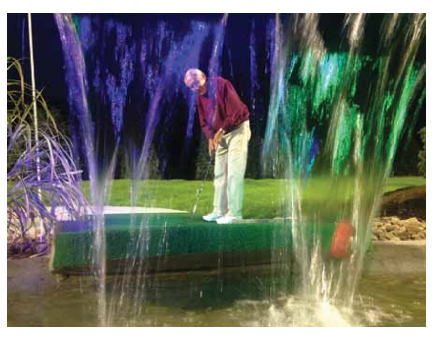
For the owner of Chuckster's, observing many guests playing miniature golf over time helps in the planning of the next location.

After attending the Rookies and Newcomers workshop at IAAPA, I then sought out a miniature golf course builder to work with. Harris Miniature Golf worked collaboratively with me to design a challenging, interest-